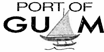
TARIFF RATE TABLE